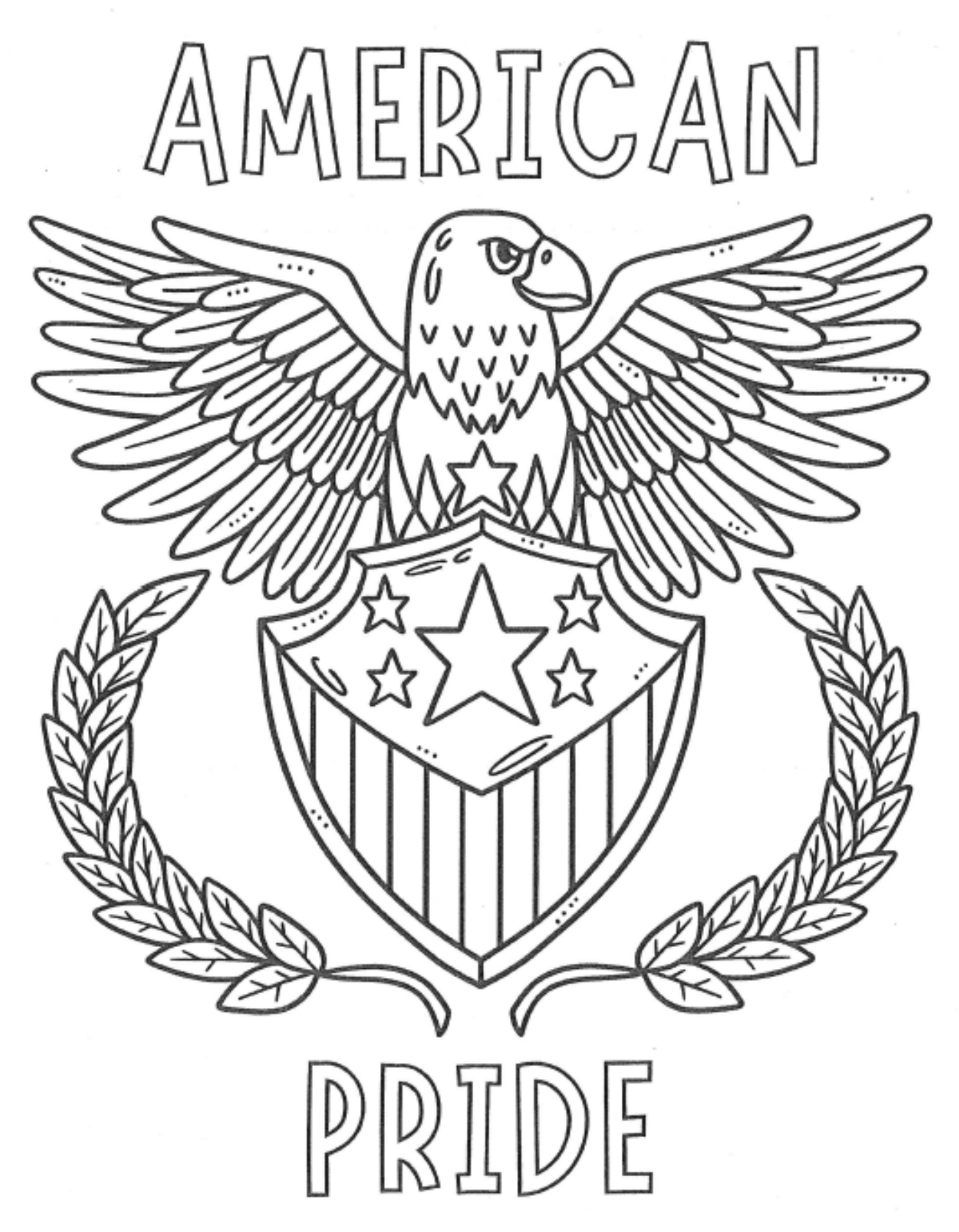
Note: This picture is for students in Grades 4and 5